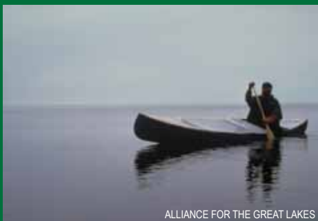
ALLIANCE FOR THE GREAT LAKES