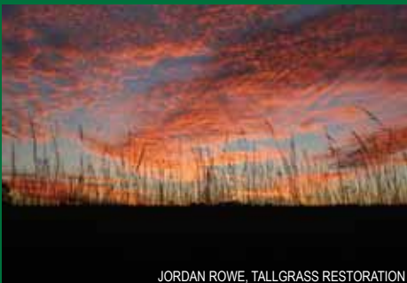
JORDAN ROWE, TALLGRASS RESTORATION