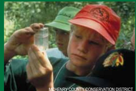
MCHENRY COUNTY CONSERVATION DISTRICT