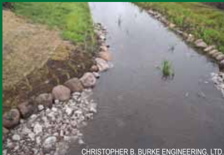
CHRISTOPHER B. BURKE ENGINEERING, LTD.