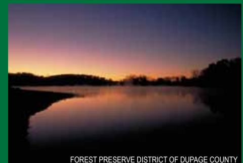
FOREST PRESERVE DISTRICT OF DUPAGE COUNTY